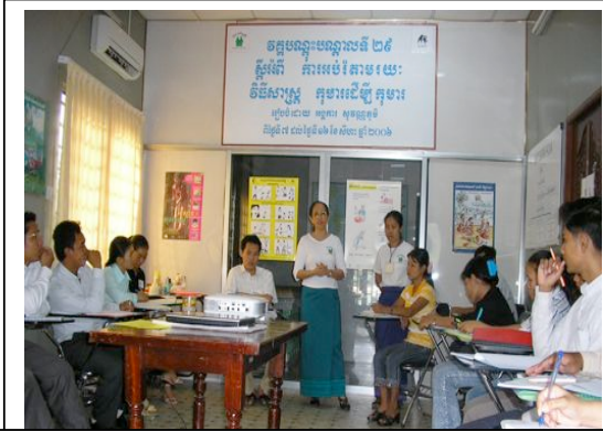
The 29 th Training Course on Child-to-Child approach

SP provides training services on child-to-child approach to other NGOs, partners, and government officials. In addition, materials for child-to-child approach are also available for sales.