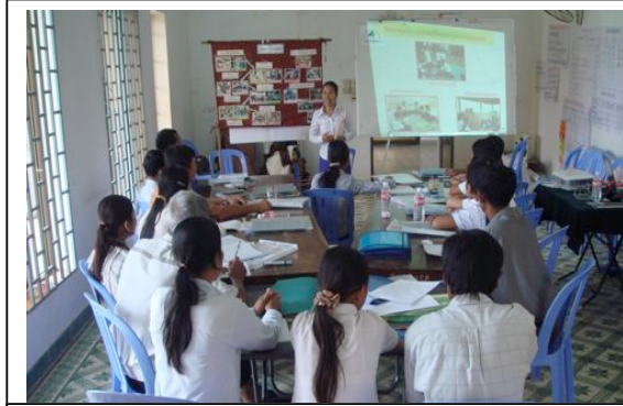
The 30 th Training Course on Child-to-Child approach