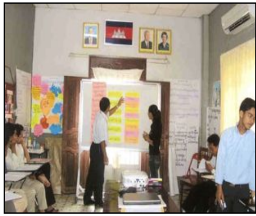
The 29 th Training Course on Child-to-Child approach