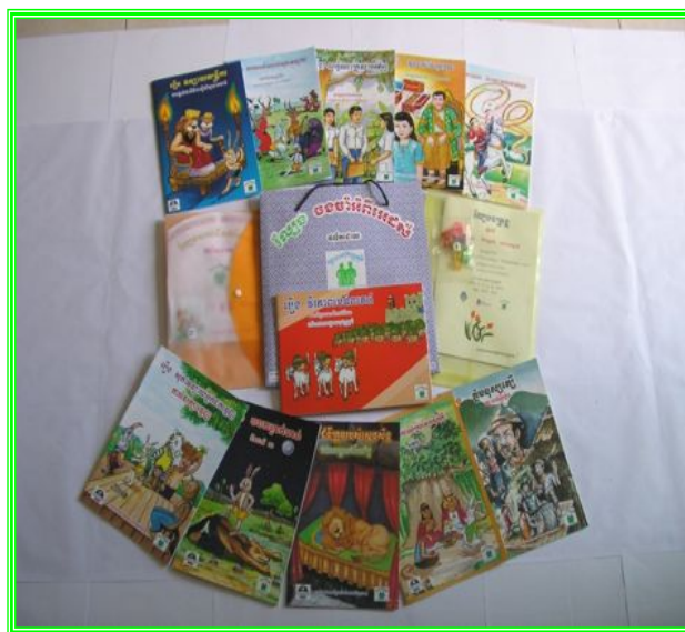
Storybooks and game materials produced by SP for child-to-child educational activities.